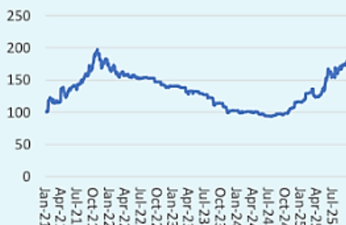
Prime Unicorn 30 Index Levels